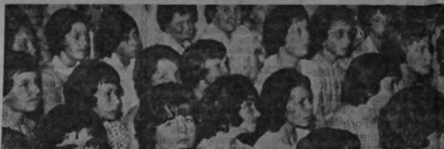
Right: Some of the pupils