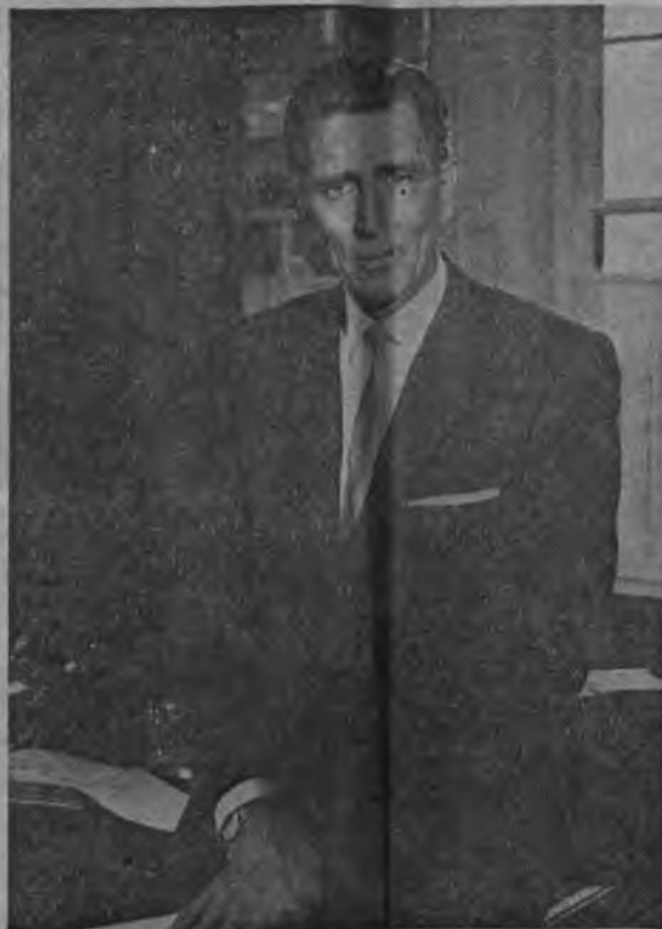
MICHAEL RENNIE, who is back again on BBC-TV.

Helen Cherry makes one of her fairly rare appearances on TV later this year. She is in a 17th-century musical play called "The Brokenstein Affair," which has just been recorded.