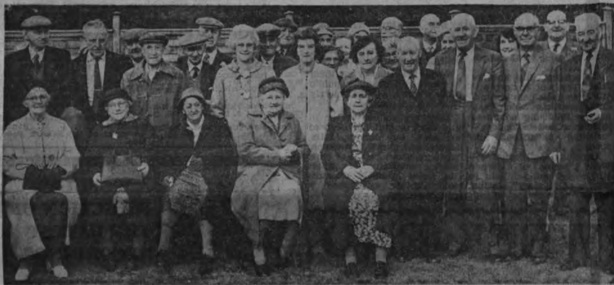
Above: Ready for a day by the sea. Old age pensioners and members of Wragby-road Social Club committee pose for a photograph before starting off on their annual outing to Skegness. Some 70 pensioners made the trip.