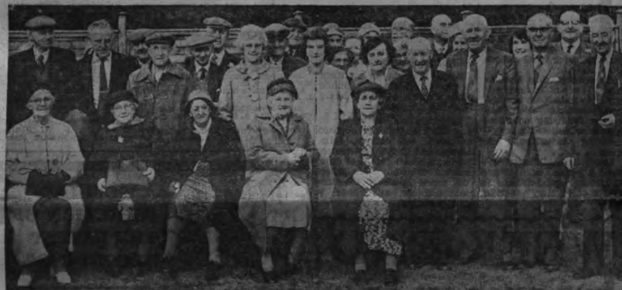
Above: Ready for a day by the sea. Old age pensioners and members of Wragby-road Social Club committee pose for a photograph before starting off on their annual outing to Skegness. Some 70 pensioners made the trip.