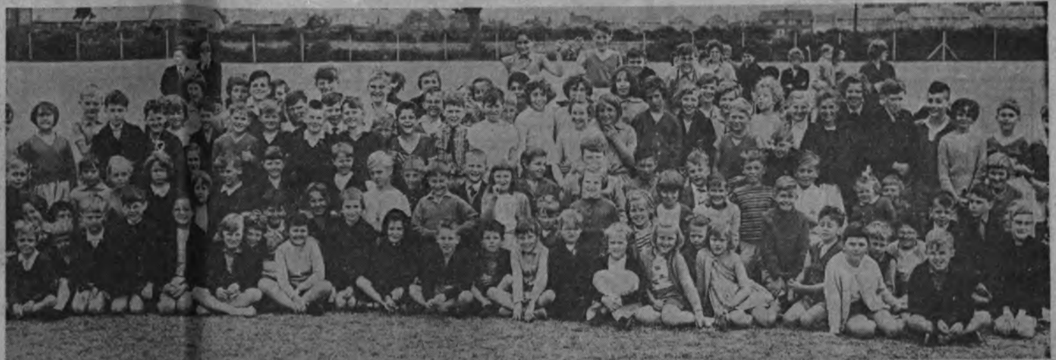
Above: Pupils of the Fosse Way School, North Hykeham, at their annual sports day. The Sports trophy was won by Newport House.